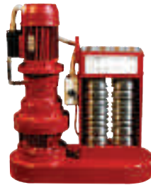
Full line of electro-mechanical and hydraulics swagers.

Give us a call today to find out how we can make your business more profitable by providing Wire Rope Cable Railings to the commercial and home construction trade.