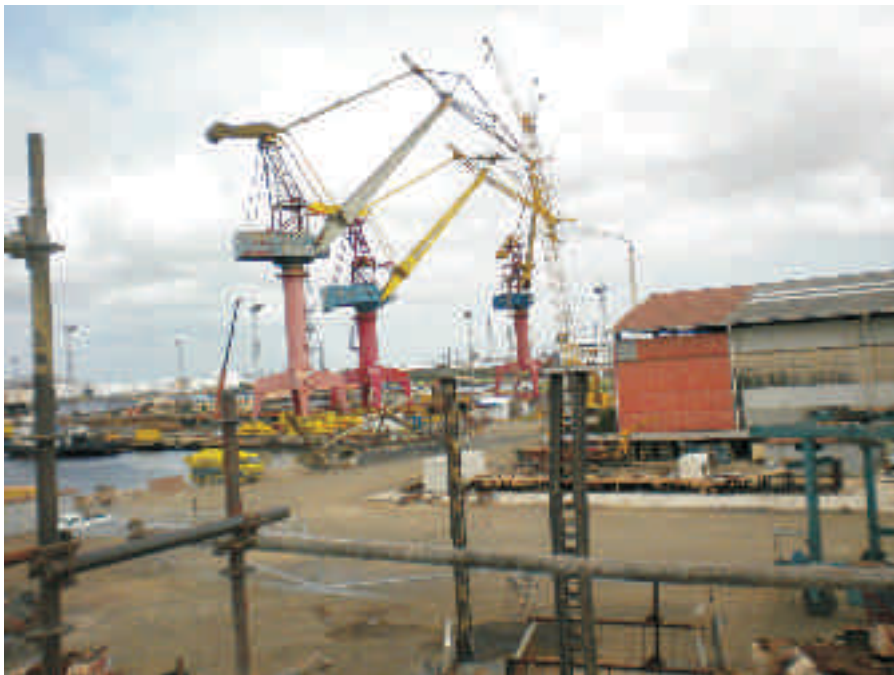
In the shipyard in Curacao. The picture is taken from scaffolding around the rudder of the Sophia D, looking onto shipyard cranes on the left and the machine and weld shop on the right.

The Subsea Solutions Alliance does. They rely on Miami Wire and Rope for their rigging materials and Delta Rigging for their chain hoists. "It doesn't matter if the hoists are man-