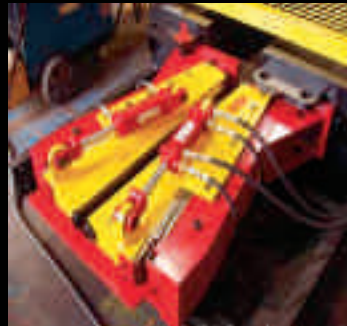
Wire Rope Grips - Any Size