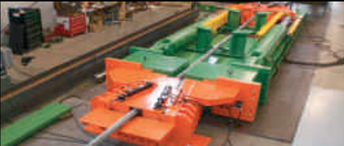
Pre-Stretch Bed with Wire Rope Grips