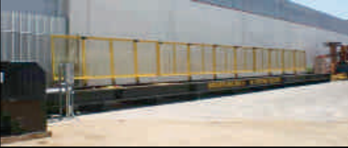
Horizontal Testing Machines 10,000 lbs. to 5,000,000 lbs. capacities - Any Length