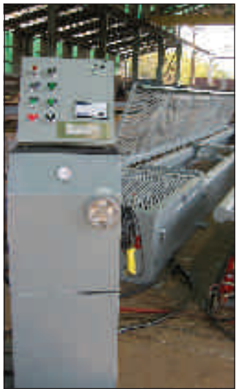
Portable Test Bed (grip available) Capacity: 50,000 - 250,000 lbs.; 20, 30 or 40 foot length.