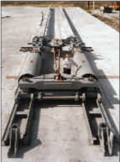
3,000,000 lb. Test Bed at Dreyfus Cortney Lowery in New Orleans, LA