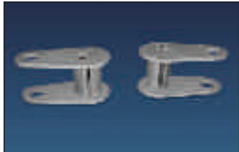
Web Grip. Capacity: 6" and 12" webbing