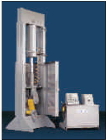
Vertical Break Test Machine. Capacity: 350,000 lbs. with 12" Web Grip.