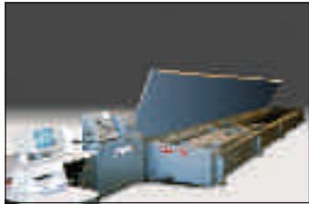
Horizontal Test Bed with Computer system. 150,000 - 3,000,000 lbs.