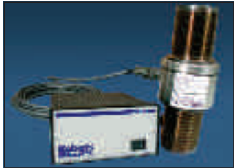
Load Cell and A2D Converter. Load Cell manufactured with 5:1 design factor. A2D Converter uses your computer screen as your display.