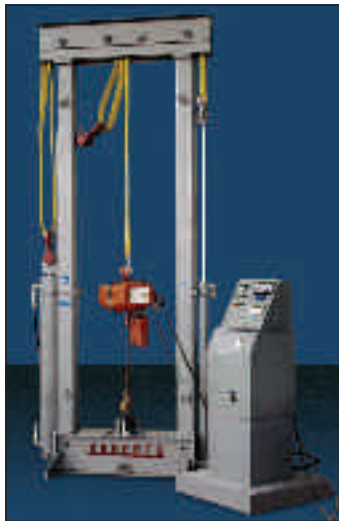
Vertical Test Stand. 50,000 lb. Dynamic testing (hoist moving) or static testing (hoist not moving).