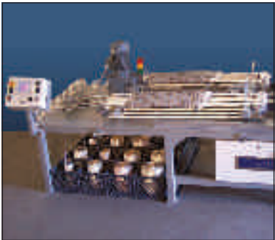
5 HP Round Sling Machine