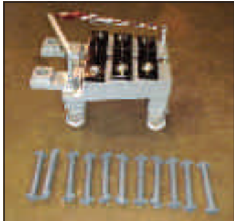
Wire Rope Grip. Capacity: 1 1/2", 2", 2 1/2", 3", 4"